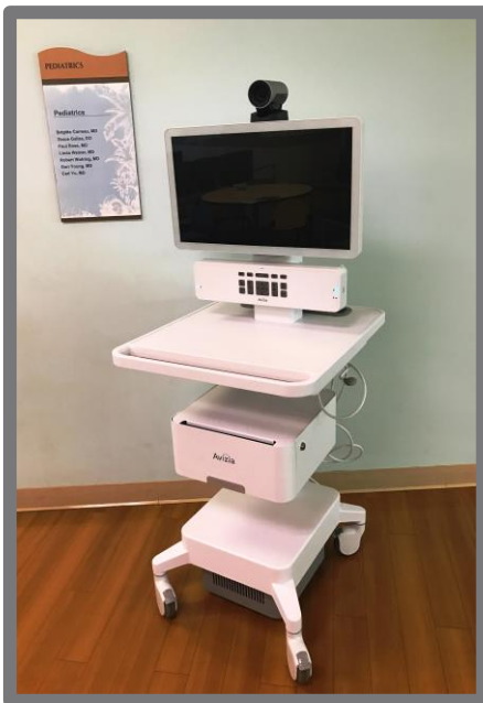
Avizia CA 750 and Horus scope